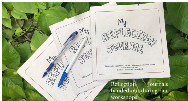
Reflection Journals handed out during our workshops

This newsletter is a glimpse into what we have been working on and what to look out for.