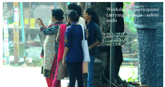
Workshop participants carrying out a safety audit